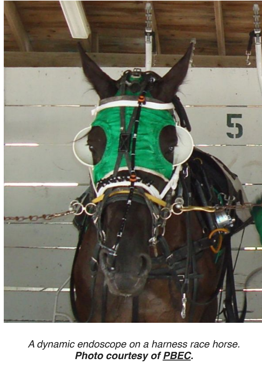
A dynamic endoscope on a harness race horse.

During exercise, the amount of air moved in and out of the horse increases proportionately to how hard the horse is working. The more demanding the work, the more oxygen must be used. A horse at rest inhales approximately 3.5 liters of air per second (L/s), and increases exponentially to 70 L/s at maximum exertion, according to Dr. Priest.